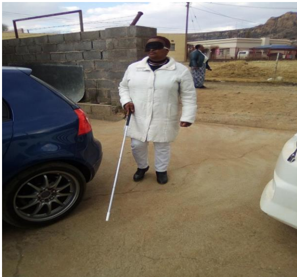
Training workshop for teachers of Special education at Mohloli – oa – Bophelo