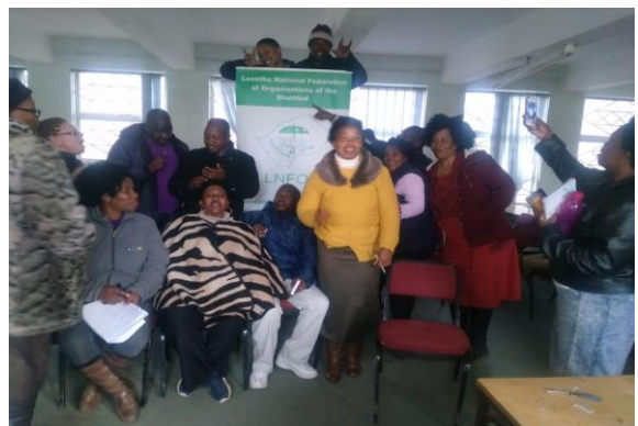
Teachers are getting training on special education Mafeteng