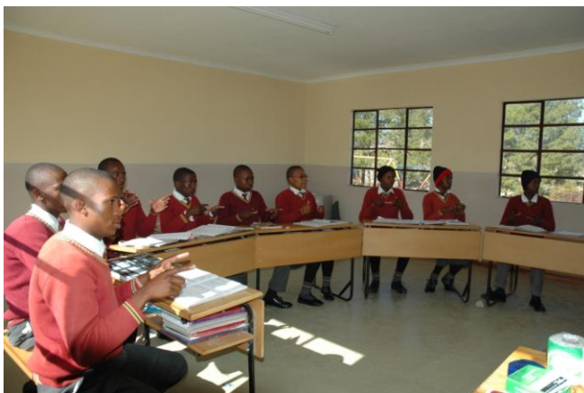
Class 7 of Kananelo Centre for the deaf left for winter classes