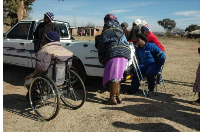
People with disabilities participated at the public gathering