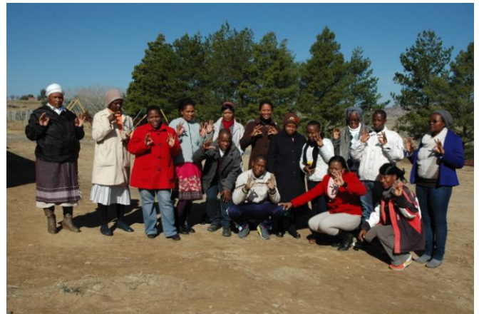
Group of service providers that attended the basic sign language training at Kananelo