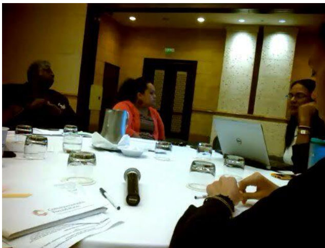
Participants at Commonwealth Minister's Conference