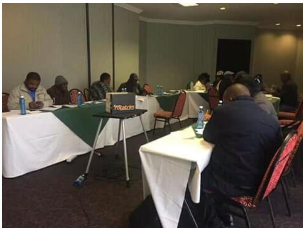
Lesotho human Rights civil society organisations reviewing of the disability equity bill final before moving to the parliament