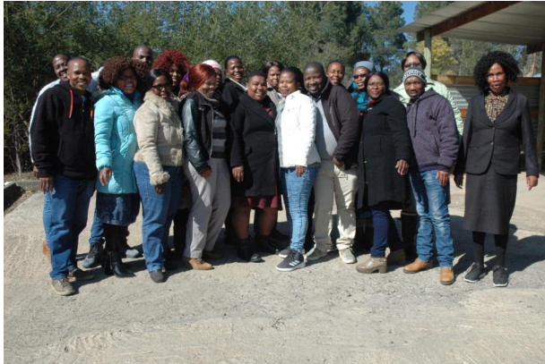
Berea teachers attended Inclusive Education training