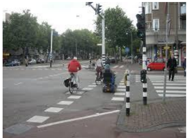
This is the example of accessible infrastructure to everyone

During the program individual persons with disabilities registered their concerns on service delivery by the ministry of social development.