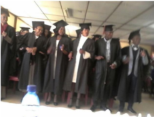
New Sign Language interpreters at the graduations