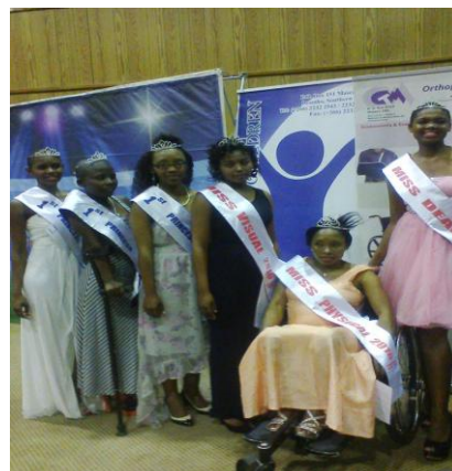
Lesotho host Miss Disability Lesotho