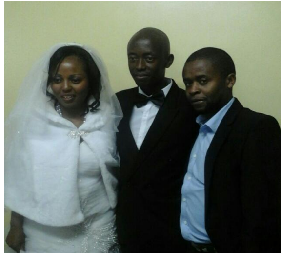
Nomhlankaze's wedding – an intellectual disabled girl