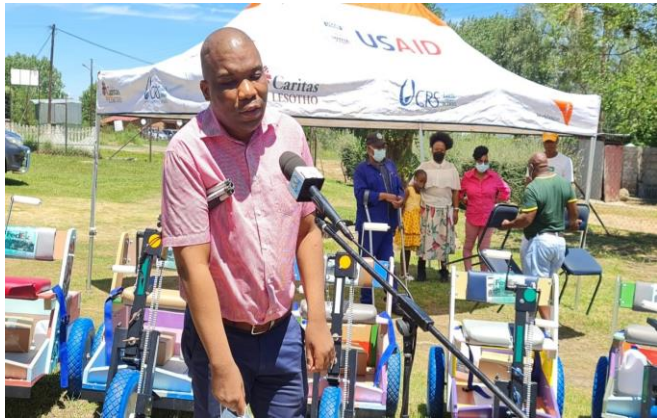
Sensitization meeting to public and private sector on inauguration of Disability Advisory Council in Mafeteng district