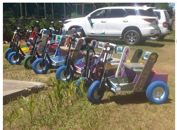
These are the Freedom carts provided to Lesotho National Association of the Physically Disabled members