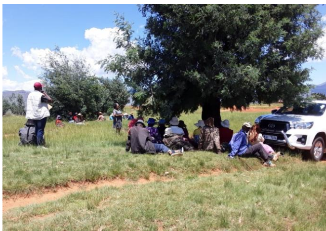
PISA/LNFOD held Public gathering at Makeoana Community Council in Berea District