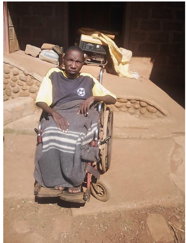
This is the situation people with physical disabilities are living without having assistive devices.