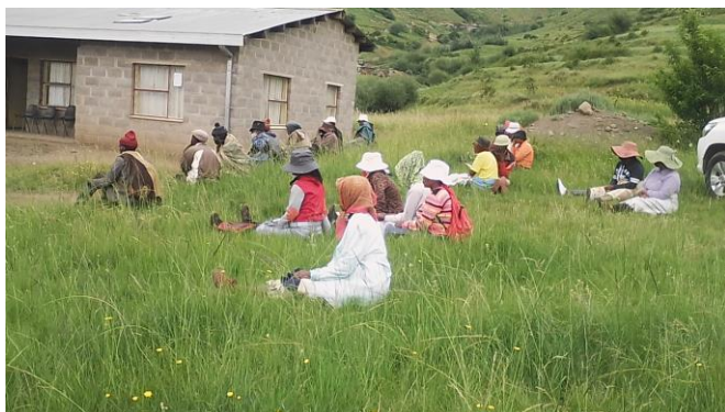
Open session discussions at Khanyane Hlotse urban council in Leribe and Ha Mahlekefane