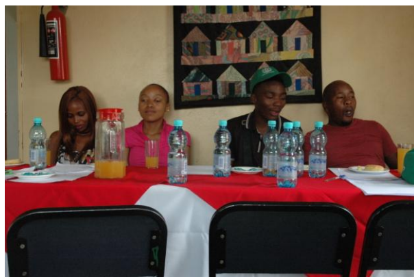
Staff of institutions for persons with disabilities during the training of Assistive Technology (AT) Database Mapping