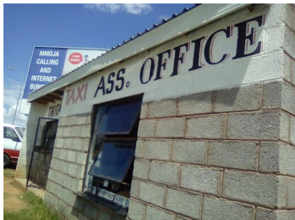
This is the transport office visited for sensitization about issues of disability