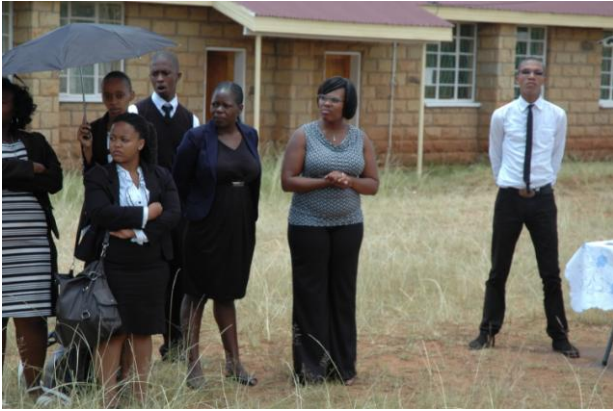
NUL students from Law faculty introducing Legal Aid clinic at 'Nqoe Community council to PWDs