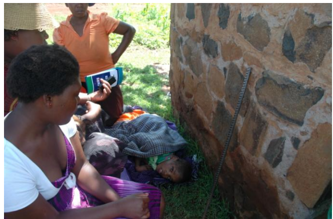
Challenges that we met during electoral education at Motete #3 Constituency