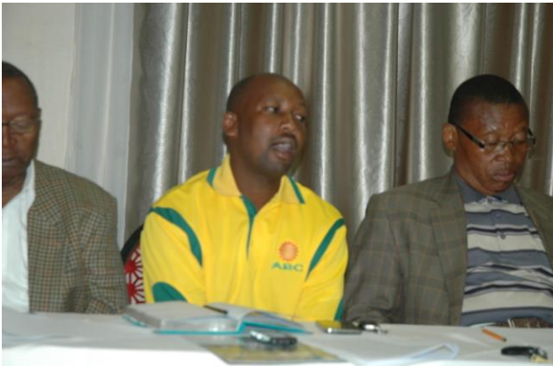
Political parties presenting their manifestos before people with disabilities