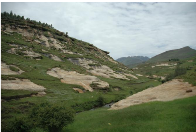
Places PWDs have to travel to electoral polling stations