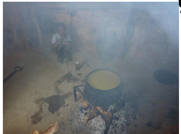
This is how Basotho women are going through daily when preparing meals for their families

Women are historically disadvantaged due to our social and cultural beliefs which are full of stereotypes. In addition, women with disabilities are worse than the others because they have disability, often poor with no access to livelihoods programs.