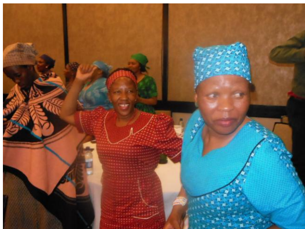
Women are happy at the celebration at Lesotho Avani Hotel