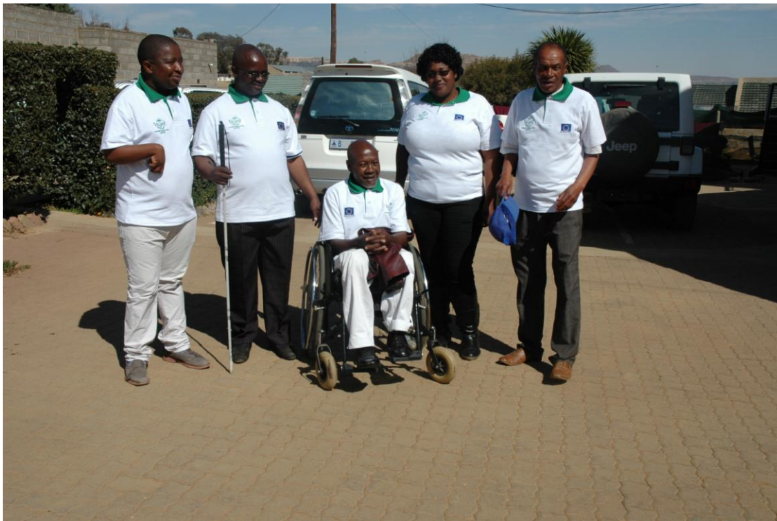
The National Coordinator and 4 District Coordinators from Mphahle'shoek, Berea, Maseru and Butha-Buthe

The participants were also highlighted to stand for upcoming local government elections that will be held in the country next year scheduled to be held early next year. This would mean a great achievement People with disabilities are also expected to stand to be elected as community councilors.