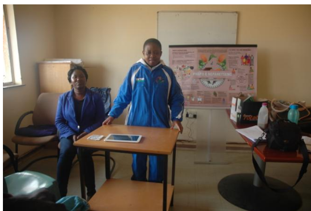
Ms. Likopo, a deafblind lady during the assessment of PWD's Rights