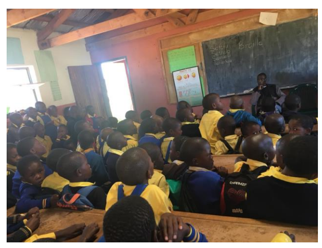
The visually impaired persons delivering disability awareness concerning fundamental human needs and rights at schools