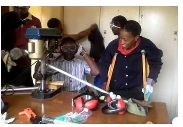
This is one company of persons with disabilities needs financial support